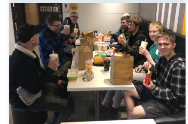
Men's Retreat crew