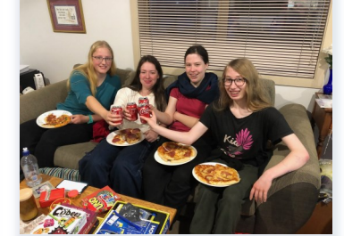
Teen girl sleepover