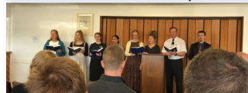
Youth special music