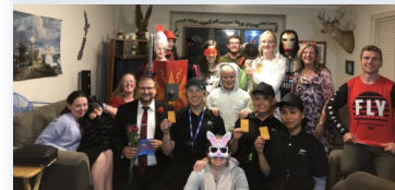
Costume Fellowship Fun