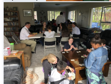
Youth activity (below)