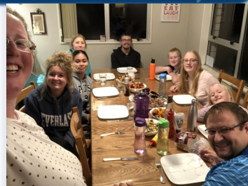
Our table full with Bible college students