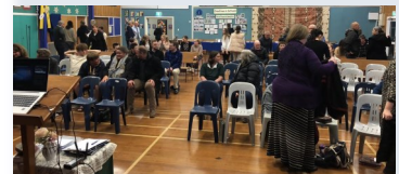
Creation Ministry International at our church