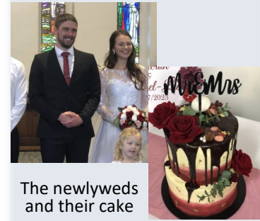
The newlyweds and their cake