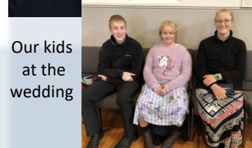
Our kids at the wedding