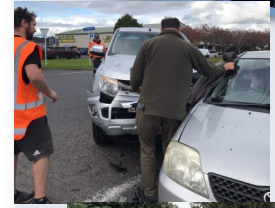
God's provision of safety and a car