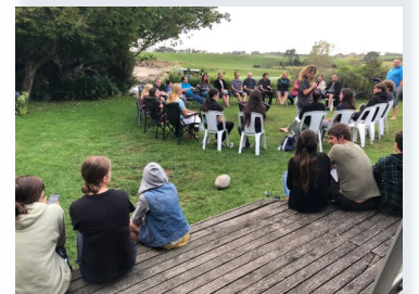
Church fellowship at our house while Miners were here.