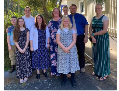
Comstock and Miner families